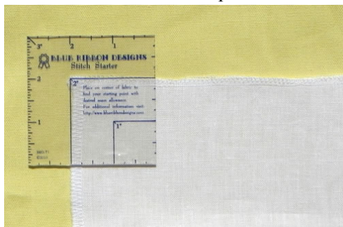
Finding 2" Seam Allowance

For your convenience, the STITCH STARTER has 1" (one inch) and 2" (two inch) seam allowance lines marked, as well. Needlework smalls or pieces that do not require framing often use a smaller seam allowance.